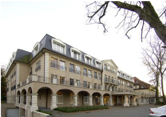
Zonneweelde – Rijmenam (BE) – existing situation

Cofinimmo supports its operator-tenant Senior Living Group (Korian Group) in the reorganisation of the Zonneweelde nursing and care home in Rijmenam, for which the necessary permits were obtained. Works will start during the third quarter of 2017.